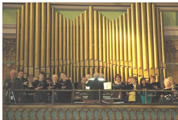
St. Lucia's Choir