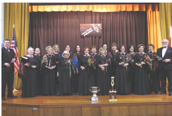
Marcella Kochanska Sembrich Chorus

We invite you to join us for musical performances by: